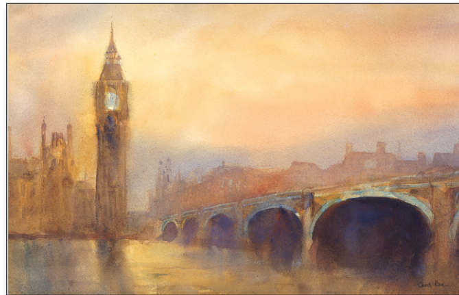
Right: Westminster Bridge, 34cm x 51cm