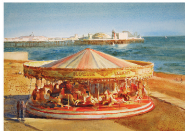
Carousel, Brighton