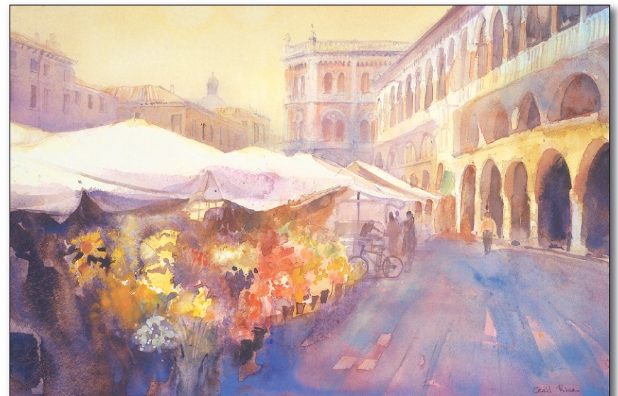
The Market, Padua, 34cm x 52cm