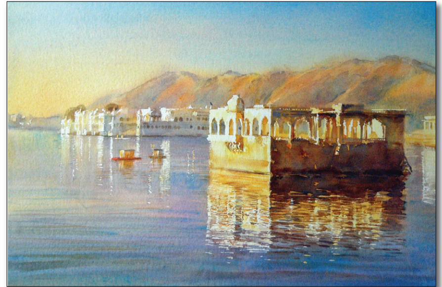
Lake Palaces, Udaipur, 34cm x 24cm