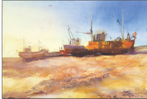
Fishing boats, Hastings, 35cm x 51cm